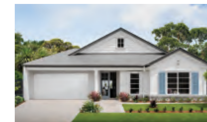
Porter Davis Homes Palmview 31 Shelter Island Facade

Home Size: 285m 2 Lot Size: 480m 2 Lot Frontage: 16m