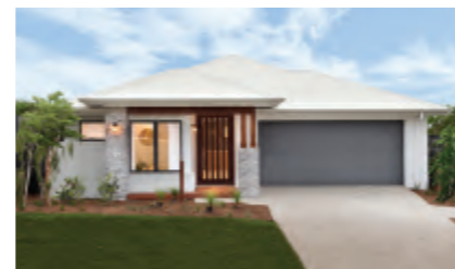
Brighton Homes Meridian 27 Seaside Facade

Home Size: 325.27m 2 Lot Size: 420m 2 Lot Frontage: 14m