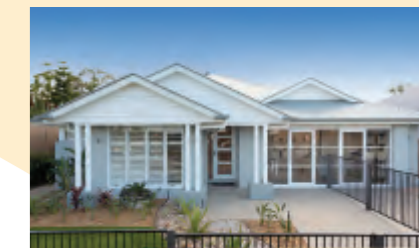
Plantation Homes Kingsford 25 Eastport Facade

Home Size: 253.1m 2 Lot Size: 448m 2 Lot Frontage: 14m