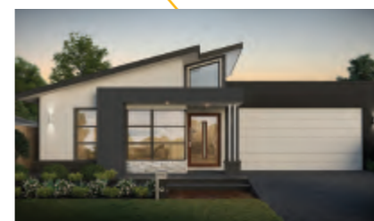
Desire Homes Diamantina 250 Stradbroke Platinum

Home Size: 255m 2 Lot Size: 480m 2 Lot Frontage: 16m