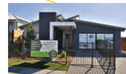
DBC Homes The Taylor Contemporary Facade

Home Size: 279m 2 Lot Size: 486m 2 Lot Frontage: 16m