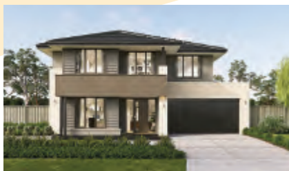
Metricon Fintona 33 Alpine Facade

Home Size: 308.02m 2 Lot Size: 420m 2 Lot Frontage: 14m