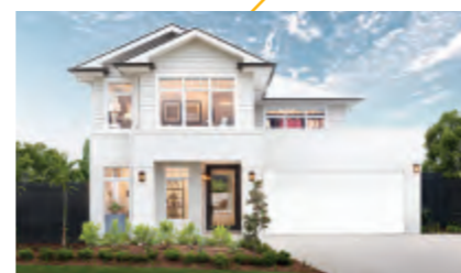
Brighton Homes Huxton 35 Emerson Facade

Home Size: 270.50m 2 Lot Size: 531m 2 Lot Frontage: 18m