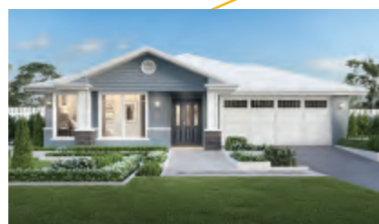
Clarendon Homes Ashgrove 29 Hamptons Facade

Home Size: 230.8m 2 Lot Size: 375m 2 Lot Frontage: 14m