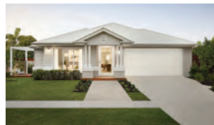
Coral Homes Santorini 27 MK II East Hamptons Facade

Home Size: 308.02m 2 Lot Size: 420m 2 Lot Frontage: 14m