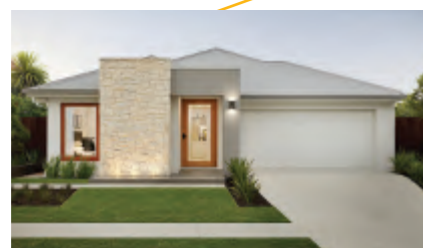
Coral Homes Grange 25 Crest Facade

Home Size: 266.95m 2 Lot Size: 516m 2 Lot Frontage: 16m