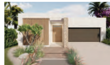
Hallmark Homes Urban 245

Home Size: 225m 2 Lot Size: 375m 2 Lot Frontage: 12.5m