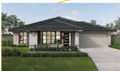
Metricon Mantra 28A Domain Facade

Home Size: 285m 2 Lot Size: 480m 2 Lot Frontage: 16m