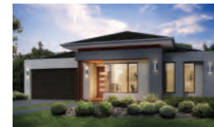
Neptune Homes Santa Rosa Tempo Facade

Home Size: 245m 2 Lot Size: 375m 2 Lot Frontage: 12.5m