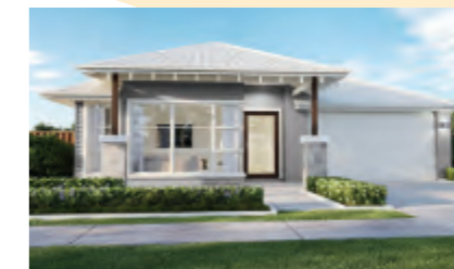
Bold Living Homes Sophia 253 Ranch Facade

Home Size: 298.31m 2 Lot Size: 503m 2 Lot Frontage: 16m