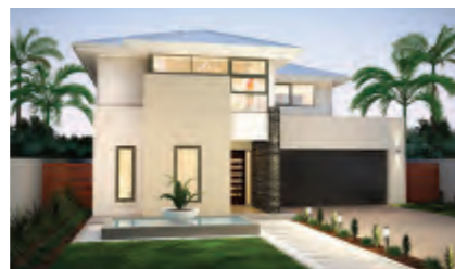
Clarendon Homes Brookwater 33 Contemporary Facade

Home Size: 252.01m 2 Lot Size: 471m 2 Lot Frontage: 16m