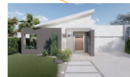
Hallmark Homes Verge 279

Home Size: 250m 2 Lot Size: 420m 2 Lot Frontage: 14m