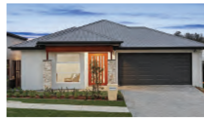
GJ Gardner Homes Kimberley Resort Facade

Home Size: 248.18m 2 Lot Size: 420m 2 Lot Frontage: 14m