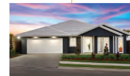
GJ Gardner Homes Coolool Hamptons Facade

Home Size: 322.33m 2 Lot Size: 540m 2 Lot Frontage: 18m